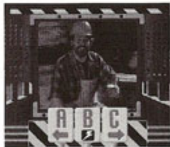
The Button Control Panel

Push the D-Pad Left arrow to go Left Push the D-Pad Right arrow to go Right The Up or Down arrows of the D-Pad to start your Action